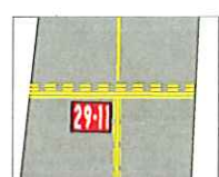
DETAIL "A" TYPICAL RUNWAY HOLDING POSITION MARKINGS, SURFACE PAINTED HOLD POSITION SIGN AND ENHANCED TAXIWAY CENTERLINE MARKINGS. SHALL CONFORM TO FAA AC 150/5340-1, MOST RECENT EDITION NTS